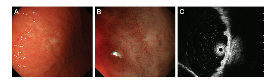
Figure 2. Oesophagogastroduodenoscopy images of the gastric MALT lymphoma. A pale lesion with indistinct boundaries is noted under white light observation (A) and magnifying observation with narrow-band imaging (B). Endoscopic ultrasonography confirms that the lymphoma is confined to the gastric mucosal layer (C).