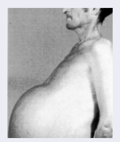
Patient with marked ascites.

The events leading to abnormal sodium handling in patients with cirrhosis are complex and controversial, however. Investigators have advanced several theories suggesting the involvement of a constellation of hormonal, neural, and hemodynamic mechanisms (Epstein 1996; Laffi et