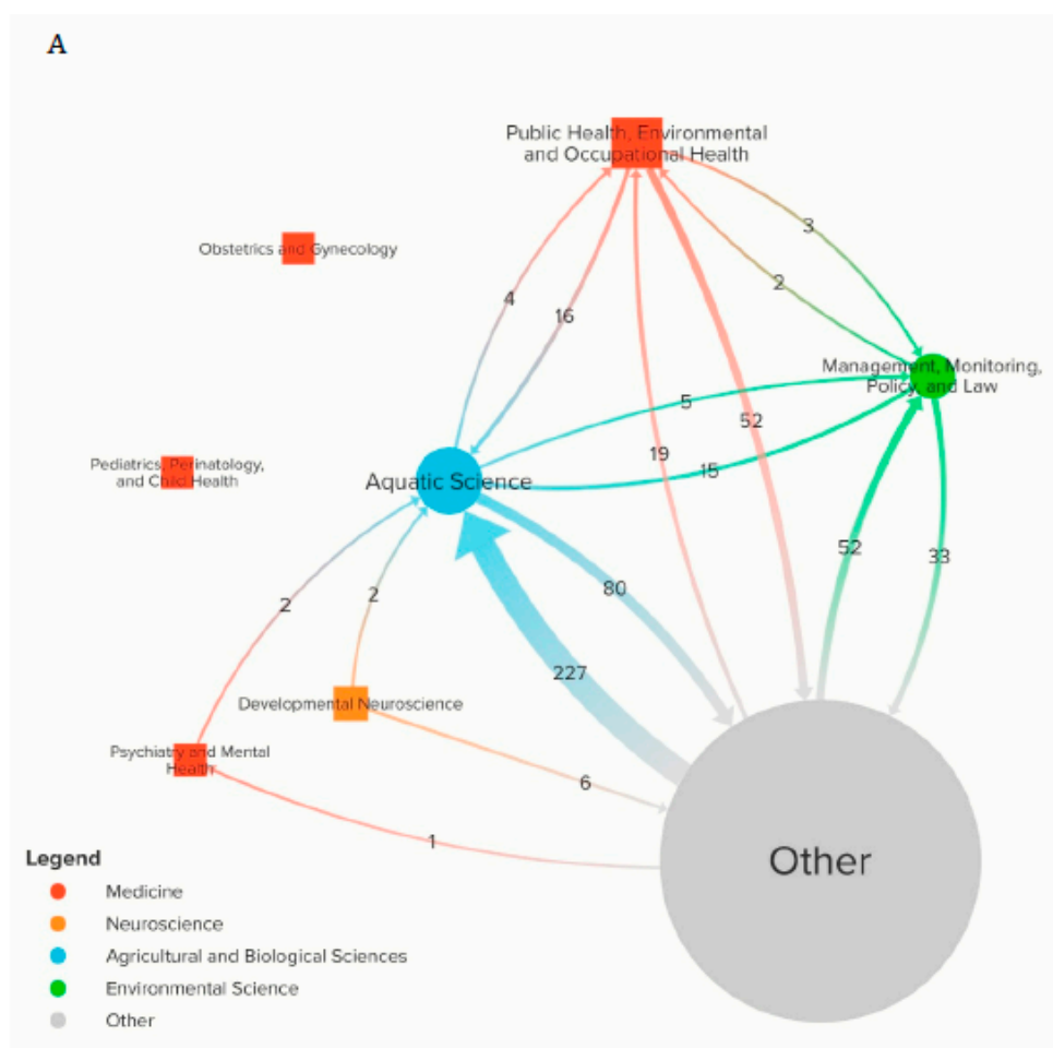
Figure 2. Cont.

Kumu ( https://kumu.io ) (accessed on 11 March 2021) was used to build the citation network visualization (Figure 2). Link and node data were imported directly into the Kumu map. The size of the nodes and thickness of the links were set to be proportional to the number of articles in a particular subject category and the number of articles cited between pairs of subject categories, respectively. Arrows indicate directionality. The direction of the links was determined by the direction of the citation: from the citer to the cited.