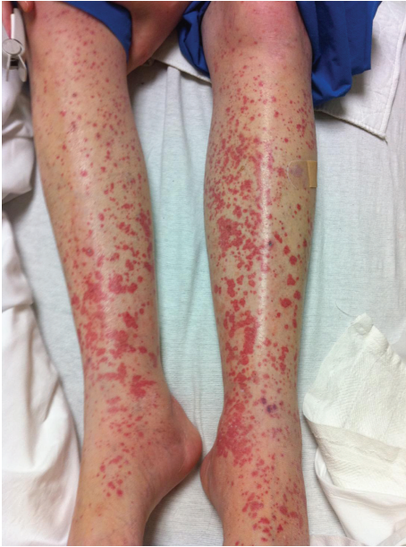
FIGURE 1: On day 6 after starting vancomycin, the patient develops a pruritic, nonblanching erythematous rash on both legs, buttocks and lower back area.

skin manifestations include maculopapular rash, bullae, papules, nodules, ulcers, and livedo reticularis. There is no specific laboratory test for LV. The diagnosis is based on the clinical picture and histopathologic features of the skin biopsy. It is thought that the pathogenesis involves circulating immune complexes being deposited into vessel walls and activating the complement pathway. Causes of LV include drugs, infection, connective tissue disease, and malignancy. Drugs may act as haptens and activate the immune response. An estimated 10–20% of all cutaneous vasculitis cases are attributed to drug administration including \beta -lactams, diuretics, NSAIDs, methotrexate, azathioprine, etanercept, cyclosporine, allopurinol, sulfasalazine, gold salts, antithyroid agents, anticonvulsants, and antiarrhythmics [1]. By far, antibiotics have been the most common drugs reported to cause cutaneous vasculitis, especially \beta -lactams [2]. Vancomycin is well recognized as the cause of different types of hypersensitivity reactions, including red man syndrome, IgE-mediated anaphylaxis, and immune-mediated skin reactions such as vancomycin-related linear IgA bullous dermatosis [3–5].