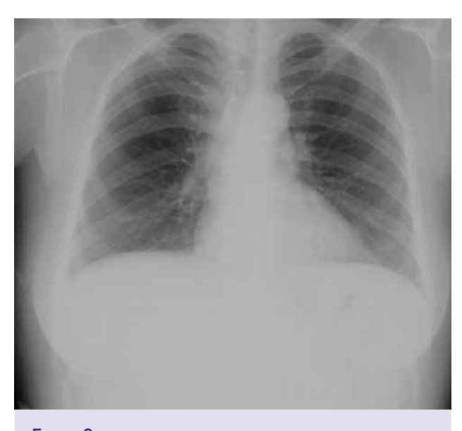
FIGURE 3. Post-treatment posteroanterior chest radiogram.

Adult onset Still's disease is a disease whose diagnosis can be made by excluding infectious, malign, autoimmune, and autoinflammatory diseases, and in consideration of its characteristic clinical, and laboratory findings. For definitive diagnosis, Yamaguchi criteria can be used. Its major criteria consists of higher body temperature at 39°C lasting for at least one week, marked nonpruritic macular/maculopapular salmon-colored rashes on the torso or extremities persisting for at least 2 weeks, leukocytosis (>10.000/ml), and neutrophilia (>80%). Minor criteria include sore throat, lymphadenopathy, hepato-