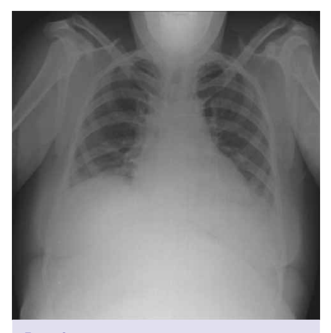
FIGURE 2. On pre-treatment posteroanterior chest radiogram costodiaphragmatic sinuses are not distinctly visualized, high-lying diaphragms, and an enlarged mediastinum were observed.

(14–150). Glucose, creatinine, AST, ALT, ALP, Na, K, complete urinalysis, ANA, RF, and ENA profile were unremarkable. On thoracal imagings, bilateral hilar lymph nodes of which the largest being 2 cm in diameter, bilateral pleural effusion, and atelectasic areas in the parenchyma surrounding the pleural effusion were observed (Figure 1, 2). On abdomi-