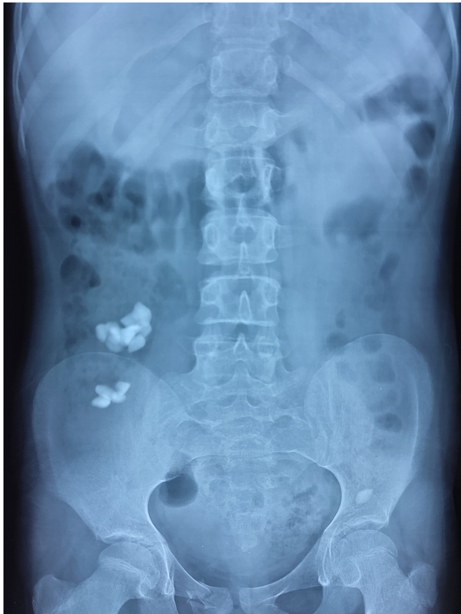
FIGURE 3: Plain abdominal X-ray on follow-up visit after a week.

Follow-up plain abdominal radiograph (frontal projection) showed significant improvement in the disease process that was noted in the previous old X-rays.