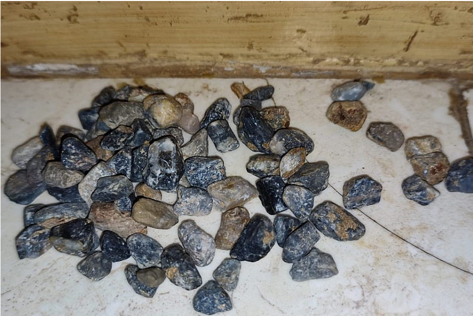
FIGURE 2: Image showing the spontaneously passed lithobezoar.

Her blood investigations (Table 1) suggested microcytic anemia. Her condition improved significantly in a few days; hence, she was discharged home on laxatives, multivitamins, and iron supplements on the fourth day of admission, with a daily follow-up plan with serial X-rays for the next few days. On her one-week follow-up visit to the clinic, she was more active and smiling. There was a great deal of improvement noticed in her clinical status. The follow-up X-ray of the abdomen (Figure 3) revealed partial clearance of the lithobezoar. Laxatives were continued to ensure complete evacuation. She was referred to pediatric psychiatry and genetics for further evaluation. On a two-month follow-up visit, blood investigations showed improvement in the hemoglobin and iron levels and with that, the pica behavior was resolved.