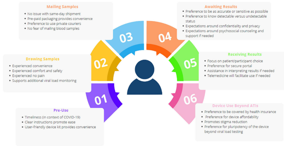
Figure 2. Summary of ATI participant experiences with home-based blood collection device for viral load testing.