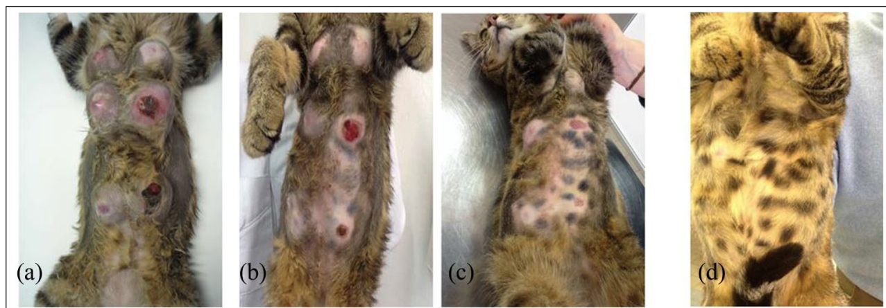
Figure 1 (a) Clinical manifestation of mammary fibroadenomatous hyperplasia. (b) Cat after 1 week of treatment with aglepristone. (c) Complete remission of clinical signs after 4 weeks of treatment. (d) Follow-up after 3 months

hormone induces the proliferation of epithelial and stromal glandular ducts until hyperplasia. 11–13