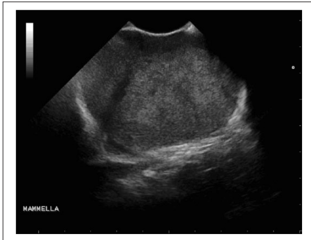
Figure 2 Ultrasonography of mammary glands with a homogeneous glandular structure and regular margins, characteristic of benign lesions