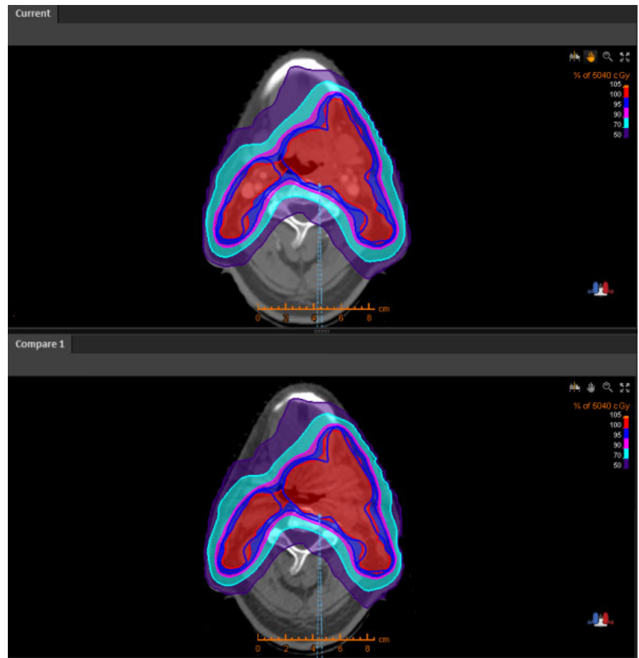
FIG. 2. Planning CT (top) and CBCT (bottom) for a patient with head and neck cancer. Blue lines indicate PTV, and the color wash indicates the percentage of the prescription dose.