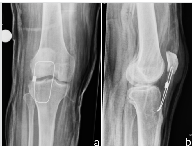
Figure 2: (a and b) Post-operative anterior-posterior and lateral radiographs of the right knee following patellar ligament repair with augmentation using a 1.6mm Dall-Miles cable (Stryker, UK).

A 42-year-old man presented to our department with bilateral traumatic rupture of the extensor mechanism of the knee. He worked as a sports course designer, was a non-smoker, and drank alcohol only in moderation. He had no medical history, was not taking any regular medications, and had no significant