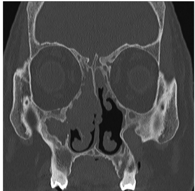
FIGURE 1 Computed tomography (CT) scan CT findings of a patient with CF CRS. Note the poor pneumatization of the frontal, maxillary, and sphenoid sinuses, as well as the sclerotic/osteitic bony remodeling. CF, cystic fibrosis; CRS, chronic rhinosinusitis

In the nasal cavity and paranasal sinuses, CF induces chronic disease due to compromise of mucociliary clearance (MCC). The viscous epithelial secretions and inspissated mucus can lead to CRS via impaired MCC, recurrent and/or persistent infection, intramucosal microabscesses, and TH1 mediated and neutrophil predominant inflammation. 1 This is in contrast to the TH2 mediated inflammation of more common forms of nasal polyposis. 1 Though less than 20% of CF patients self-report CRS symptoms, 2/3 have polyposis and up to 100% of CF patients have radiographic or endoscopic evidence of sinonasal inflammation. 1,2,4 Radiographic imaging of the paranasal sinuses in patients with CF tends to demonstrate bony demineralization, medialization of the lateral nasal wall, sinus opacification, paranasal sinus bone sclerosis, and sinus hypoplasia/under pneumatization (Figures 1 and 2). 4 Furthermore, among patients with CF, those with more severe genotypes have worse disease on sinus computed tomography (CT) scan and more often have sinus hypoplasia/aplasia compared to those with less severe genotypes. 5 Adults with CF CRS have significantly worse Lund-Kennedy (LK) scores compared to those without CF, but endoscopic findings are similar in CF patients regardless of the presence of CRS symptoms. 6 The discordance of objective findings and symptoms creates difficulty in diagnosing and treating patients with CF CRS. However, a recent prospective study