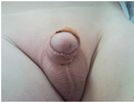
FIGURE 2: Same patient after recovery following medical treatment.

(cefazoline 100 mg/kg/day/3 doses) and oxybutynin was used in some cases (2 mg/kg/2 doses). A rifampicin dressing was used for signs of necrosis in ventral skin.