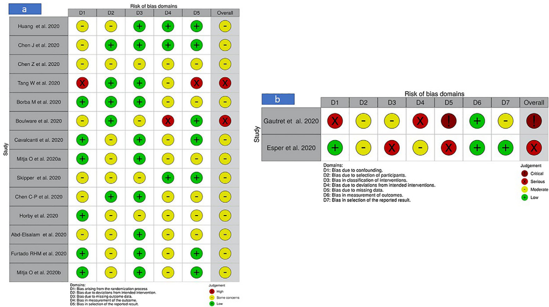
Figure 2. Summary of risk of bias: (a) RoB 2 for randomized trials; (b) Risk of Bias in Non-randomized Studies of Interventions (ROBINS-I) tool for non-randomized trials.

bias in all the domains assessed in RoB 2. Similarly, the trials by Horby et al. (2020) and Abd-El salam et al. (2020) had some concerns regarding the risk of bias in all the domains assessed except the domain of bias arising from the randomization process in the former and the domain of bias due to missing outcome data in the latter. The trial by Chen et al. (2020a) was noted to have the least risk of bias, with some concerns regarding the randomization process since no information was provided about the concealment of the allocation sequence, while all the other domains had a low risk of bias.