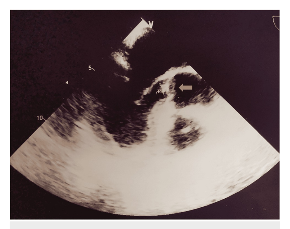
FIGURE 1: Transesophageal echocardiogram showing a tricuspid valve vegetation measuring 5.3 x 5.6 mm

A thyroid ultrasound identified a multinodular gland and a total body computed tomography scan (CT scan) was negative for suspicious lesions. A transthoracic echocardiogram identified vegetation on the tricuspid valve, confirmed with a transesophageal echocardiogram (Figure 1).