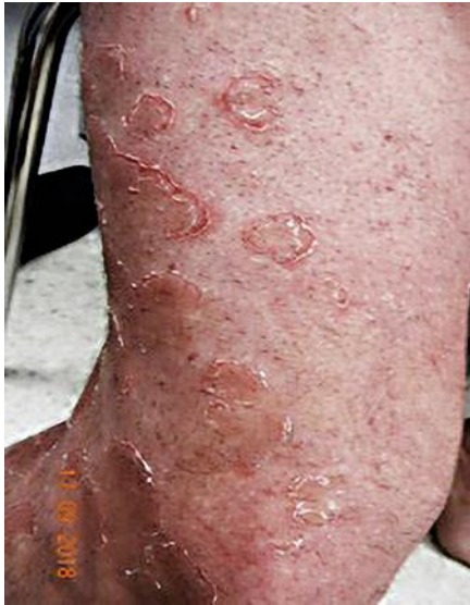
Fig. 1. Ichthyosis linearis circumflexa of the right thigh and lower leg.