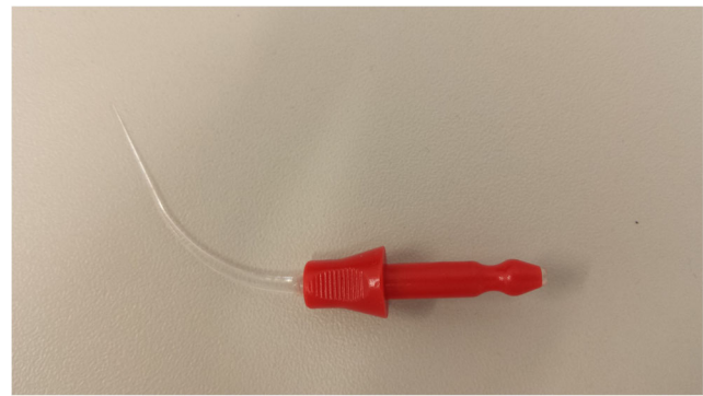
Fig. 1 Laser light guide with rod-shaped irradiation for the root canal photodynamic therapy

Root canals from the PDT group were subjected to a single PDT protocol. Before the PDT procedure, each canal was irrigated with 2 ml of sterile 0.9% NaCl and dried with a paper point R40 (VDW, Munich, Germany). Toluidine blue solution (13–15 mg/ml) was used as a photosensitiser. Dye was placed into the canal for 2 min to allow accumulation in targeted tissues. Diode laser with a wavelength 635 nm was used as a light source for the PDT reaction with 120 mW, 12 J, 2-min parameters of irradiation. Laser radiation was delivered via special light guide (Fig. 1) that was introduced into the canal,