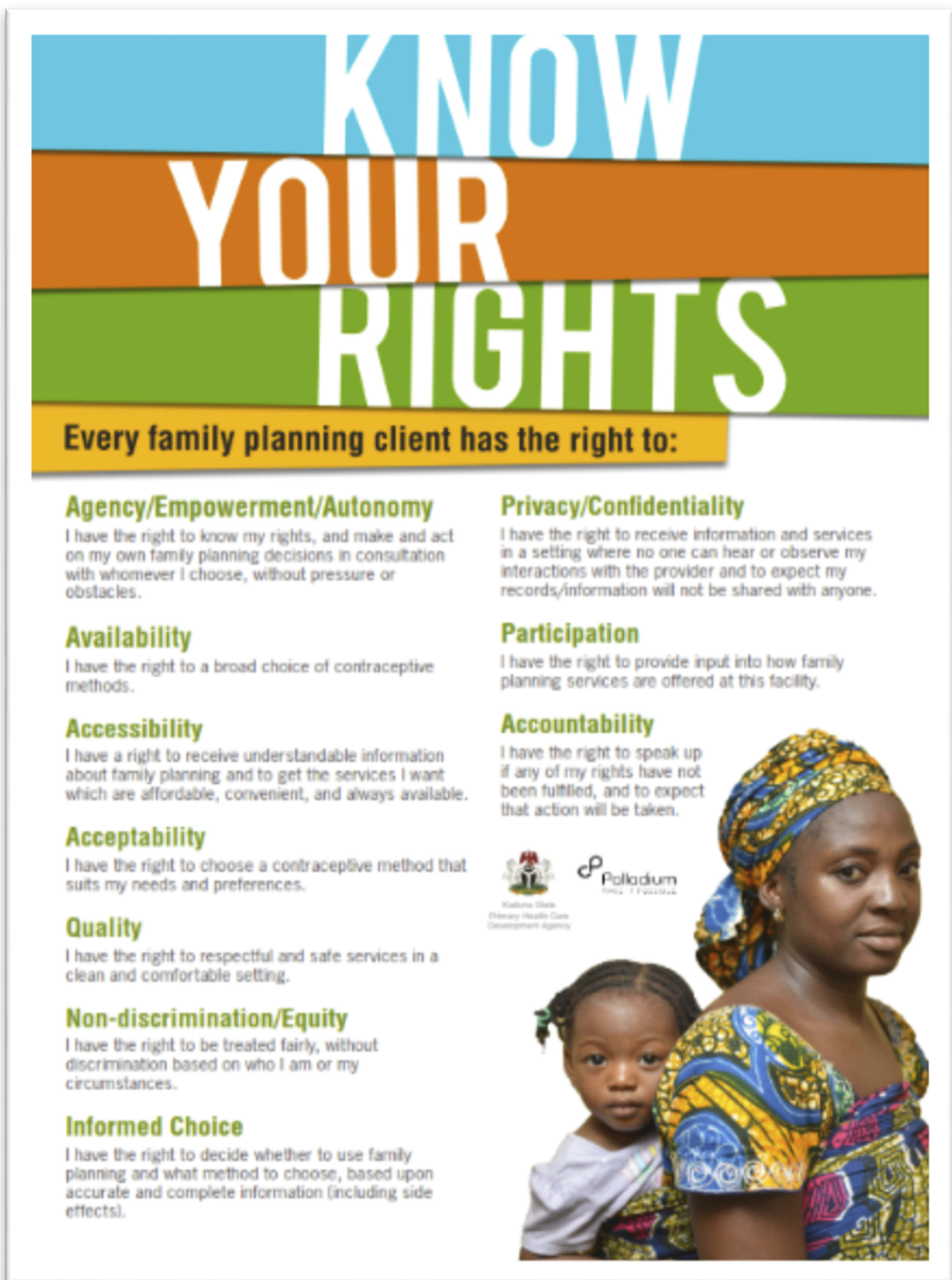
Figure 1 VRBFP poster developed for clients in Nigeria.

Notes: A similar poster was developed for Uganda by Reproductive Health Uganda. (this poster is available at: http://www.familyplanning2020.org/sites/default/files/Know_Your_Rights.pdf ).