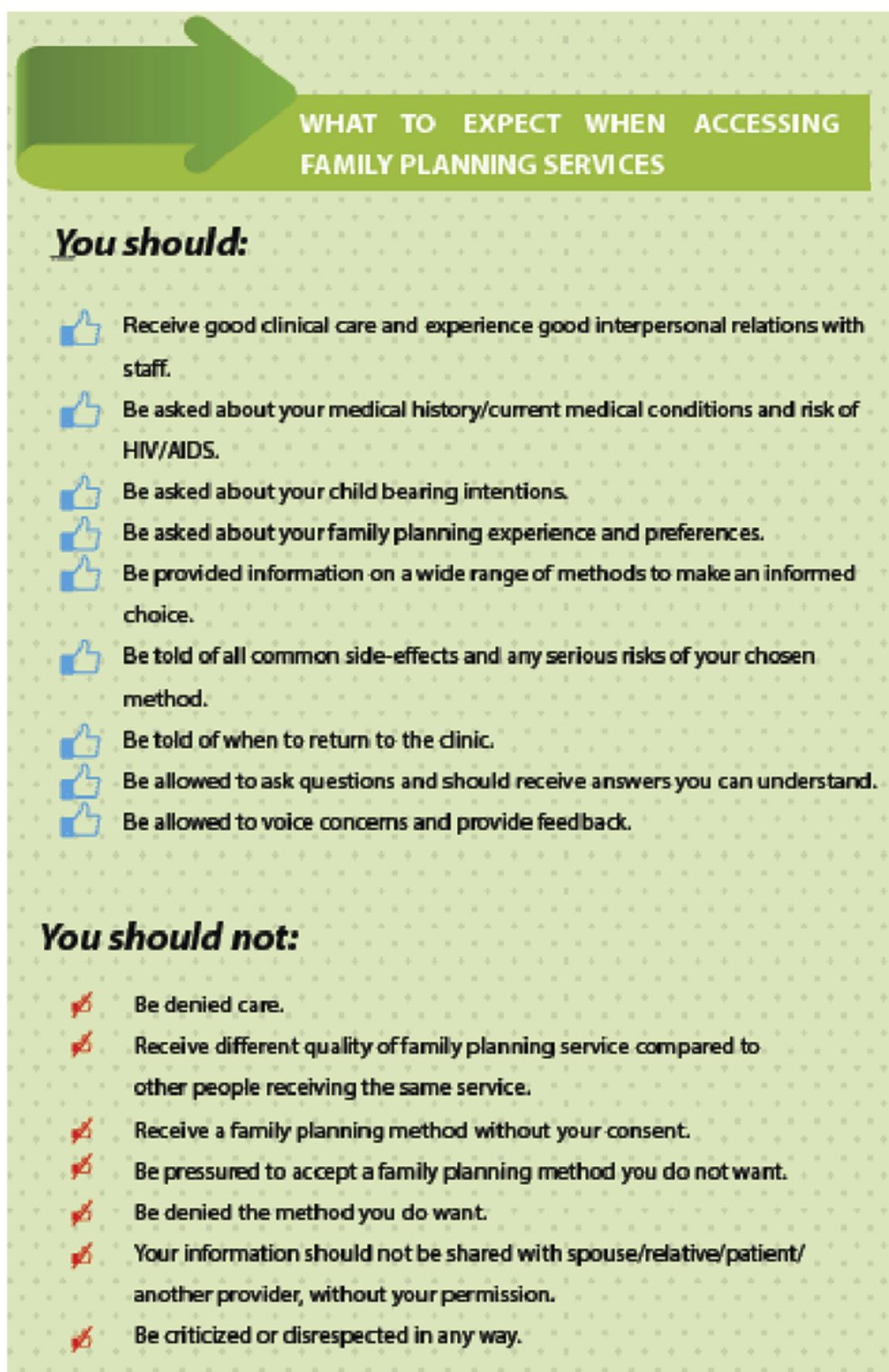
Figure 2 List of What clients should and should not expect from VRBFP Services, used in both Nigeria and Uganda.

Note: Image courtesy from Family Planning 2020, United Nations Foundation.