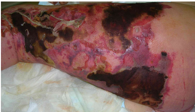
Figure 1 43-year-old male. Preoperative photograph on the day of admission. Extensive erythema and necrosis of the left leg.

The Acute Physiology and Chronic Health Evaluation (APACHE) II score on the day of admission was 31 points and the Sequential Organ Failure Assessment (SOFA) score was 18 points. The patient required fluid resuscitation, endotracheal intubation, mechanical ventilation in BiPAP (bilevel positive airway pressure) mode, continuous intravenous infusion of catecholamines (epinephrine, norepinephrine) and low doses of steroids to restore blood pressure. After obtaining cultures from the affected tissue, blood and bronchoalveolar lavage (BAL) in appropriate media, empirical, broad-spectrum antibiotics were immediately administered (meropenem 3 g/day in a 3-h infusion, vancomycin 3 g/day in continuous infusion, metronidazole 1.5/day in 3 divided doses). Because of progressive organ dysfunction, therapy was started with activated protein C, in doses of 24 μg/kg/h; continuous veno-venous hemofiltration (CVVH) was also started. After several hours, the patient developed atrial fibrillation with a ventricular rate of 140 beats per minute and his blood pressure decreased to 80/50 mmHg. Electrical cardioversion was performed three times, followed by continuous infusion of cordarone (12 mg/kg/day). During this time, intensive fluid resuscitation was administered. During the first day, the patient received 12,800 ml