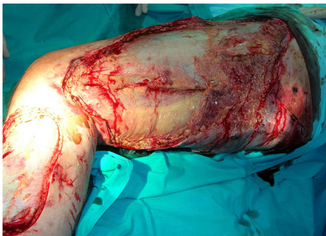
Figure 3 43-year-old male. Seventh day of treatment. Intraoperative photographs: necrotic tissue from the left leg was surgically debrided.

of intensive treatment, the patient was hemodynamically stable, and we discontinued mechanical ventilation. 25 days after admission the patient was discharged to the trauma surgery ward for plastic reconstruction of his wounds.