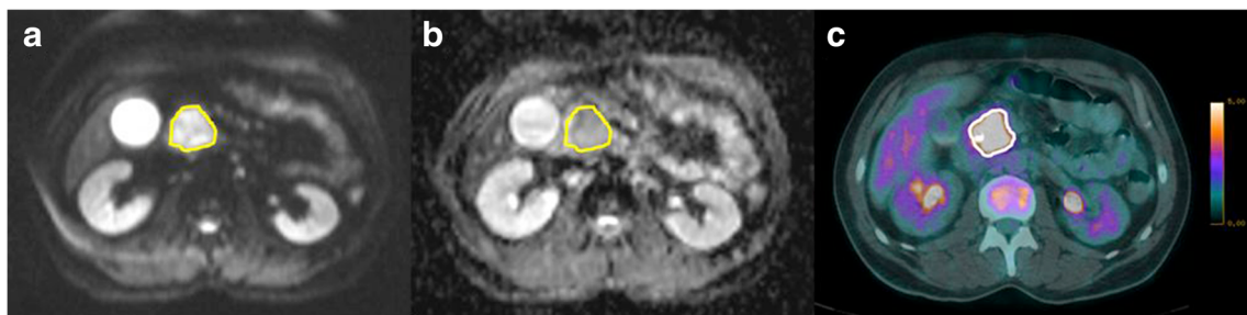
Fig. 3 Example of a patient with untreated PDAC. Diffusion-weighted MRI (a, b -value: 800 s/mm 2 ), ADC map (b), and PET/CT (c) were acquired in a 54-year-old male who underwent cephalic

Discordant results have also been published regarding the correlation between ^{18}F -FDG uptake and proliferative activity. In a study including all histological subtypes of pancreatic cancers, Hu et al [4] reported a positive correlation between SUV_{max} and Ki-67, while Buck et al [14] found no statistical correlation. Ahn et al [13] detected a significant association between SUV_{mean} and tumour grade, while Im et al [8] reported no significant association between ^{18}F -FDG parameters and tumour grade or perineural invasion, which agrees with the present results. However, Im et al also noted that TLG and MTV were marginally associated with lymphovascular invasion. Overall, these contradictory results suggest a crucial need for international standardisation of ADC measurements, and for large, multicentric studies, assessing the relationship between ^{18}F -FDG PET- and DWI-derived parameters and pathological findings in resectable PDAC.