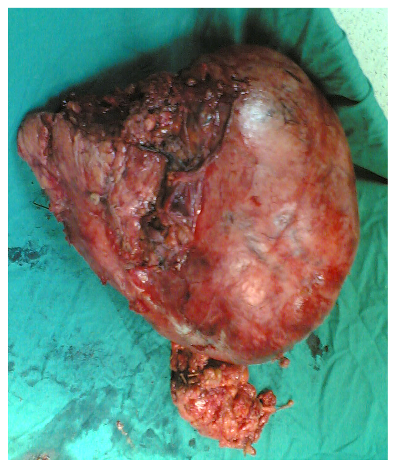
Figure 2 The posterior aspect of a GIST presenting as a huge abdominal mass attached to the left half of transverse colon with its mesocolon, body and tail of pancreas, and a part of the small intestine removed from a 28-year-old female. Abbreviation: GIST, gastrointestinal stromal tumor.

Dovepress Gastrointestinal stromal tumor