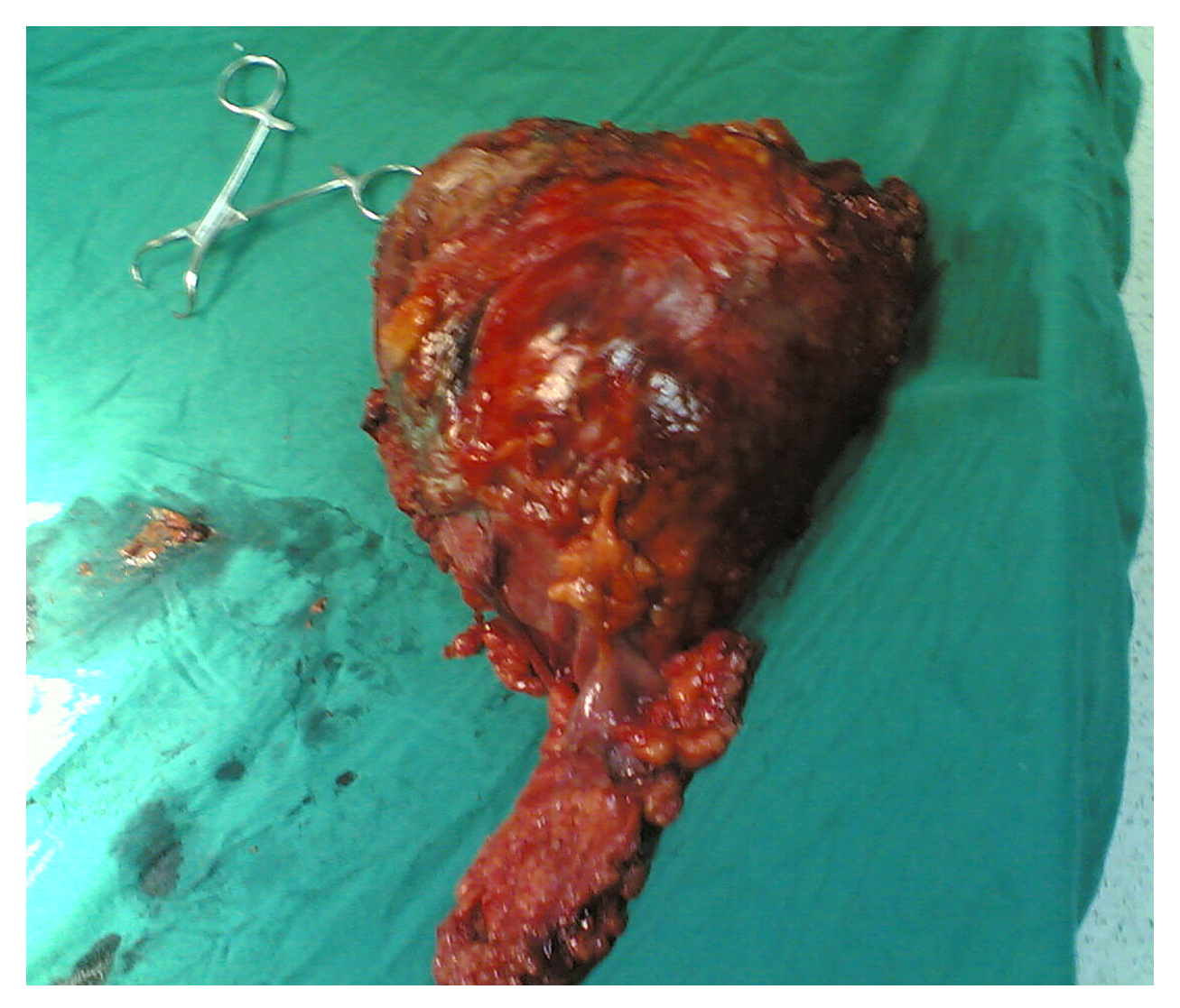
Figure I The anterior aspect of a GIST presenting as a huge abdominal mass attached to the left half of transverse colon with its mesocolon, body and tail of pancreas, and a part of the small intestine removed from a 28-year-old female. Abbreviation: GIST, gastrointestinal stromal tumor.

The mass was tightly attached to these viscera. The spleen was also removed because the splenic vein was ligated as it was traversing the tumor mass.