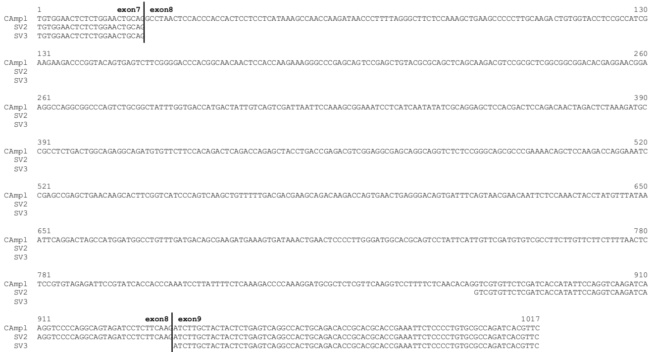
Figure 2 Nucleotide sequence of the 3 porcine PPARGC1A amplicons from primer PGC1A+/-Ex7,9. CAmpl: nucleotide sequence of the complete amplicon (1017 bp); SV2: nucleotide sequence of amplicon from splice variant in which last 66 bp of exon 8 are conserved (167 bp); SV3: nucleotide sequence of amplicon in which exon 8 is completely spliced out (101 bp).

PGC1A+/-Ex7,9. With this last primer pair, 3 different amplicons were detected and the results were tissue-dependent (Table 2). The forward and reverse primer of PGC1A+/-Ex7,9 are located in exon 7 and exon 9, respectively, which means its amplicon completely contains exon 8. Besides the expected fragment of 1017 bp (which incorporates all 916 bp of exon 8), 2 new splice variants of PPARGC1A in the pig were detected. Sequencing revealed that in these splice variants exon 8 was either partly (the last 66 bp of exon 8 were conserved) or completely spliced out, which resulted in amplicons of 167 and 101 bp, respectively (Figure 1, 2). Additional PCRs with longer amplicons (exon 4–9 and exon 4–12) confirmed the existence of both exon 8 splice variants and indicate that the other exons were preserved in the rest of the transcript. Taken together with the fact that no pseudogenes for PPARGC1A are described in any species and the use of a genomic DNA control, this makes it unlikely that our observations are the result of pseudogenes.