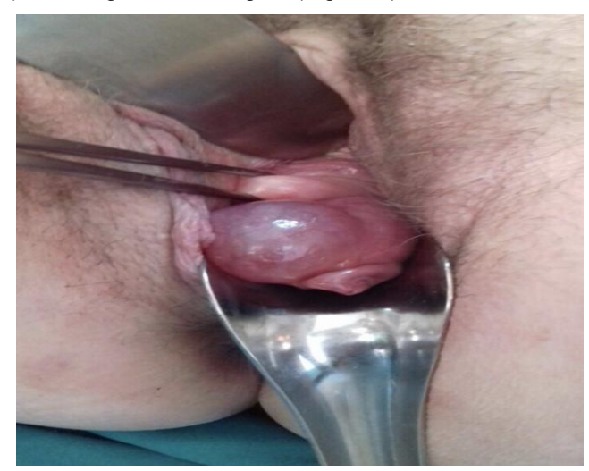
Figure 1: Cystiform polyp protruding from the vagina

A 51-year-old nulligravida woman presented with three months history of large, soft, painless, pedunculated mass measuring 11 x 6 x 4 cm protruding from the vagina (Figure 1).