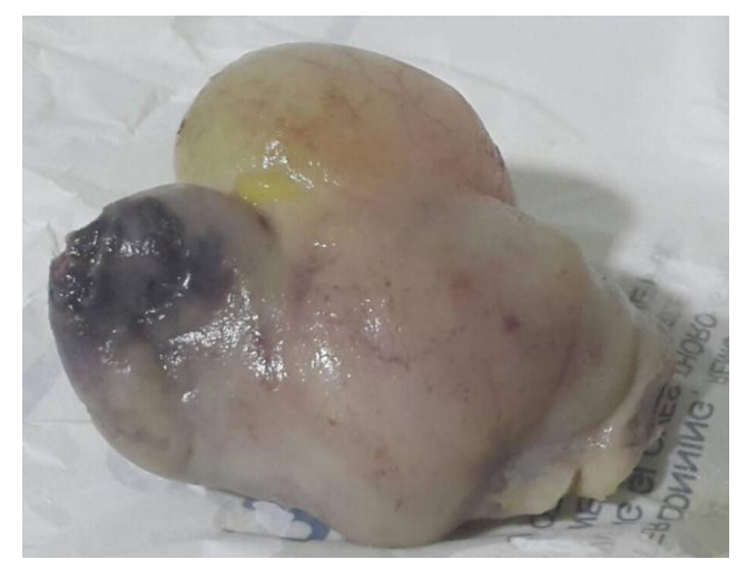
Figure 3: Three coupled cystic formations

The basis of the removed tumour was ligated with 1-0 Vicryl suture and hemostasis was achieved. Endometrial curettage was also done. The tumour was sent for pathologic examination, which revealed a polypoid pink mass measuring 11 x 6 x 4 cm. with a macroscopic appearance of three coupled cystic formations of which one was perforated (Figure 3).