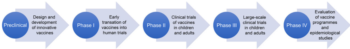
Figure 2. Summary of the steps required to take a vaccine to licensure. Once a vaccine fulfils the criteria required of it at the preclinical stage of development it must then pass through three phases of clinical trials before it acquires regulatory approval. A Phase IV clinical trial can be conducted after licensure to assess the impact that the vaccine has had on a population.

After a vaccine has been shown to be safe and efficacious, manufacturers must obtain regulatory approval from the appropriate regulatory authorities. The Medicines and Healthcare Products Regulatory Authority is the authority responsible for approvals of vaccines in the UK and similar bodies exist for other geographical regions, for example the European Medicines Agency and the Food and Drug Administration regulate approvals for European and US medicines, respectively. Vaccines will often need to undergo additional local studies before approval is granted despite the availability of data from clinical studies carried out in other regions [5].