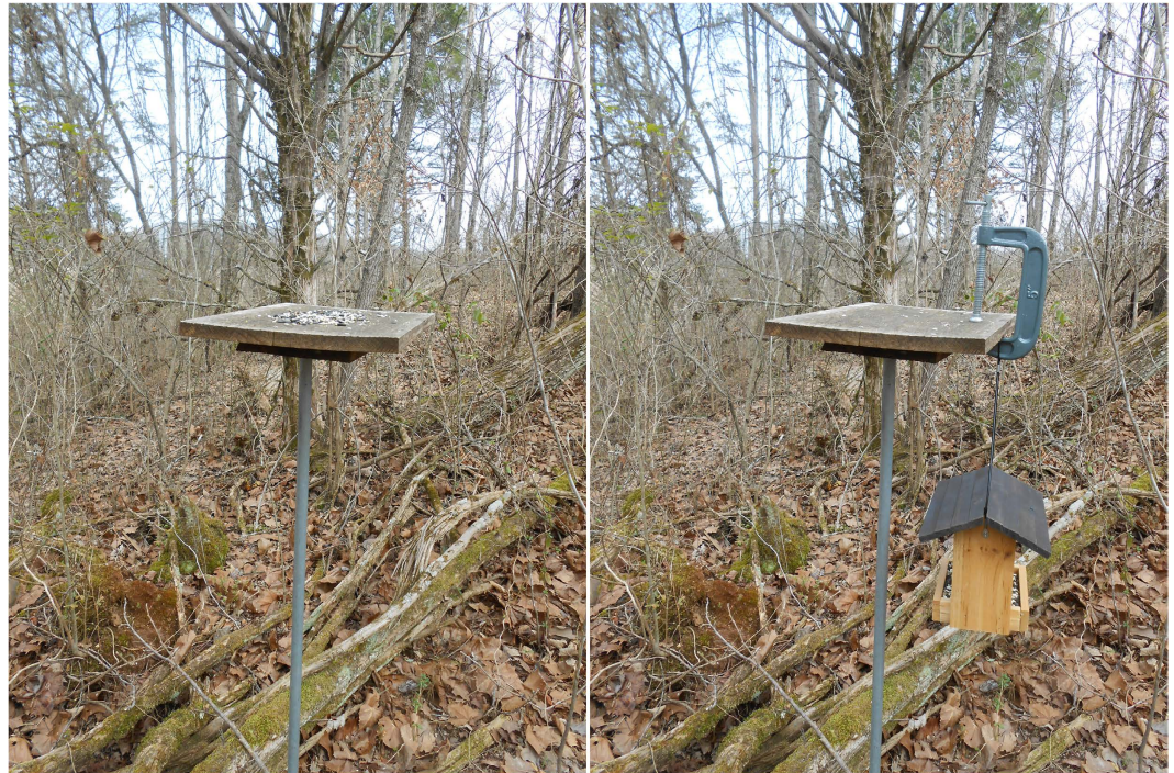
Figure 1. Photographs of the regular feeding station stocked with seed (left) and the novel hopper feeder attached to the empty feeding station (right). Note in the right photograph the seed visible in the hopper tray of the novel feeder.

depending upon the presence or absence of other species in each of three sympatric cyprinid species 16 . Willow tits ( Poecile montanus ) shifted their primary foraging areas to less-preferred parts of the canopy when they were in the presence of crested tits ( Lophophanes cristatus ) in mixed-species flocks, compared to when they foraged alone 17 . Mixed-species groups of animals could therefore represent an instance of greater diversity of species having a detrimental effect on behavior, especially for subordinate species in those groups.