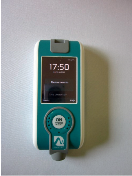
FIGURE 1: Tissue stiffness as well as oscillation frequency and logarithmic decrement were measured with the myometer MyotonPro® (MyotonAS, Tallinn, Estonia).