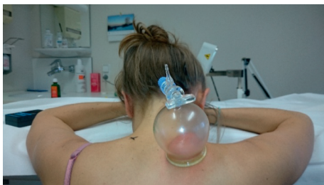
FIGURE 2: Procedure of cupping of patients with chronic neck pain: the image shows the sucking of tissue into a cupping glass, and skin is reddened after massage. The patient is seated lying head stress-free on a prepared shelf. The side of higher tissue stiffness was treated with cupping massage. The point of maximum pain and the corresponding contralateral side are marked with an “x” (one is not visible due to the cupping glass).

2.5. Questionnaires. All patients had to answer the NDI or ODI as standardized and validated questionnaires for neck pain and back pain, respectively, before and 24 hours after cupping.