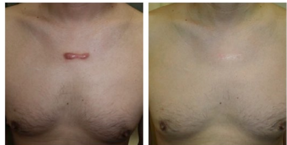
Figure 2. Pre-sternal keloid scar in a 45-year-old man treated with deprodone propionate tape. Photograph before and 36 months after initiation of treatment.

known that patients at the extremes of age have thinner skin, which facilitates steroid absorption);