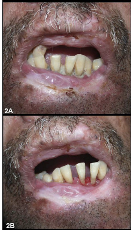
Fig. 2. 2A. Perioral scars, dental plaque due to poor oral hygiene and microstomy. 2B. Oral condition after dental plaque removal using ultrasound.

short stature, difficulty in speaking, and tremors during writing and moving. Oral hygiene was extremely poor due to microstomy (Fig. 2A). During medical history assessment, he reported the removal of three skin lesions nine years before; two of them of facial skin (basal cell carcinoma and actinic keratosis lichenoides) and another one at the chest skin (lentigo simplex) (Fig. 3). The patient had consanguineous parents and a brother with the same disease. Dental and periodontal problems were observed during clinical examination and in panoramic radiograph. An ultrasonic cleaning was performed and limitation to reach the teeth occurred due to microstomy (Fig. 2B). He was instructed to perform proper hygiene of the mouth as well as to keep a rigorous photoprotection on the lips and the rest of the body by using sunscreen moisturizers, wide-brimmed hat and appropriate clothing. Furthermore, the patient was referred to dermatological, neurological and ophthalmological treatment in order to have a multidisciplinary management of the case.