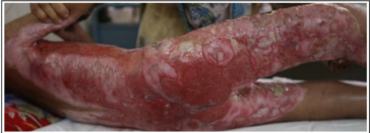
Fig.2: Partially Healed Lesion of Eczema Herpeticum with super added Bacterial infection seen as purulent discharge.

skin eruptions, malaise, lymphadenitis), treatment protocols (duration of acyclovir, healing of eruptions, need of blood transfusions) and outcome (wound healing time, length of hospital stay, contractures, re-activation of EH and/or mortality).