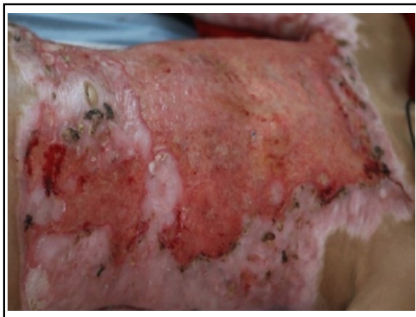
Fig.3: Healed Umbilicated lesions of Eczema Herpeticum.

Data analysis was done by using SPSS 23. Qualitative data (gender, type of burn, TBSA, previous skin disease, fever, malaise, and lymphadenitis, need of transfusion, contractures, re-activation of EH and mortality) was analyzed as frequency and percentage. Quantitative data (age, weight, hemoglobin, duration of acyclovir, wound healing time, length of hospital stay) was analyzed as mean and standard deviation. Logistic regression was used to analyze association of re-activation of EH and length of hospital stay, mechanism of burn, TBSA, gender, and age; p-value of <0.05 was taken as significant.