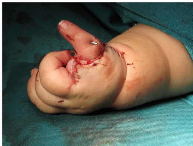
Fig. 1. Pollicization with Buck-Gramcko technique.

After diagnosis was established, serial splinting was performed for stretching and patients were referred to a neonatologist for rule out comorbidities that is contraindications for surgery. In the first stage of operative management the radialization or centralization was considered. In most of the cases the ages of the patients were between 6 to 18 months at time of the first stage of operation. The patient was placed in supine position. Under general anesthesia, surgery was performed using bilobed flap approach of Evans. A transverse incision was started on the radial side hs at time of the first stage of operation. The patient was placed in supine position. Under general anesthesia, surgery was performed using bilobed flap approach of Evans. A transverse incision was started on the radial side of the wrist, extending to ulna at an angle of approximately 90°. The flap was elevated, while dorsal veins and sensory