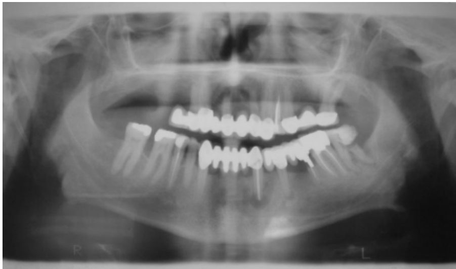
Figure 1. Panoramic radiograph of patient showing the elongated styloid process.

than 4 cm. However, the length of the styloid process has not been found to be correlated to the severity of pain. 8 In this report, we describe a case of Eagle's syndrome that was characterized by a broad tenderness in left lateral and posterior cervical as well as temporal regions.