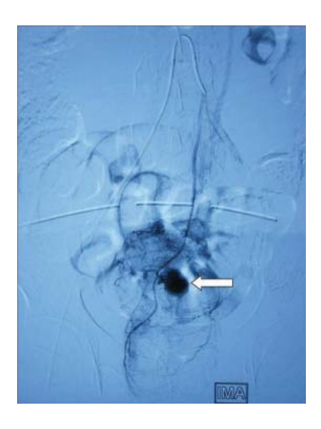
Figure 1 . Angiogram showing pseudoanyreusm arising from superior rectal artery. White arrow pointing the pseudoanyreusm on angiogram.