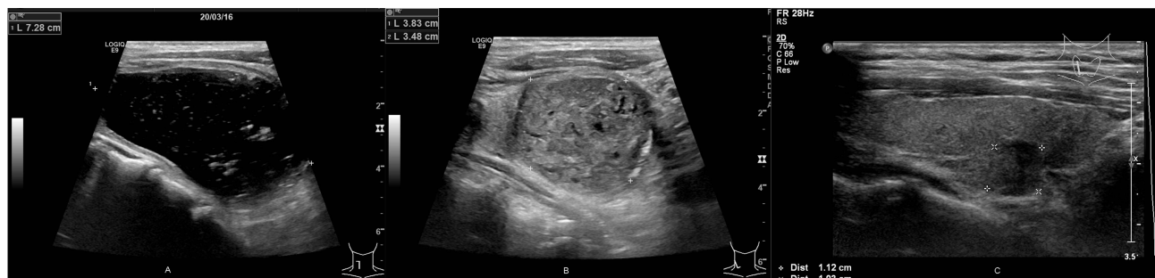
Figure 1 The left solid cyst of the thyroid gland was injected with 10mL of laurositol into the capsule in two separate injections, each retained for 5 minutes, and 8mL of laurositol injection was extracted, and the rest was retained in the capsule. Reexamination at 3 months after surgery showed that the left solid cyst was reduced, and reexamination at 6 months after surgery showed significant reduction compared with that at 3 months. (A) Laurositol injection therapy for left solid cystic thyroid nodule. (B) Left thyroid cyst solid nodule laurositol treatment 3 months after surgery. (C) Left thyroid cyst solid nodule laurositol treatment 6 months after surgery.

Nodule volume did not differ significantly between the groups at any time point, including 3 and 6 months after surgery ( P > 0.05 ). In the 1st post-operative month, the nodule volume in the observation group was greater than that in the control group, while it was smaller at 12 months. At certain post-operative intervals, such as 1 and 12 months, nodule volumes differed significantly between the two groups ( P < 0.05 , Table 1, Figures 1–2).