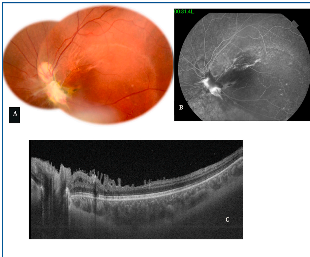
Fig. 3. Five years after the injury. A: Fundus photography shows a superior dragging of the optic disc, fibroglial scarring, retinal vessel narrowing and retinal epithelium hyperplasia. B: FA shows hyperfluorescence of the cicatricial tissue. C: SS OCT shows disorganisation of internal retinal layers and macular thinning.

and the lamina cribrosa from the scleral rim. The avulsed optic nerve is either partially or completely disinserted and it can be associated with other retinal lesions [1,5]. Several mechanisms have been proposed such as severe forced rotation of the globe which avulse the optic nerve from a weakened scleral area, the second theory is that a sudden rise in the intraocular pressure caused by compression of the globe or by sudden forward propulsion of the globe as a result of increased intraorbital pressure causing disruption at the weaker lamina cribrosa [6]. It was classically reported after a finger poke to the globe [7] but it has also been reported after bicycle or motorcycle accident and animal kick [8]. The avulsion can be missed initially due to vitreous and retinal hemorrhage overlaying the optic nerve, in such cases, ocular ultrasonography (US) can be helpful and may exhibit a posterior ocular wall defect in the region of the optic nerve head characterized by hypoechoic defect [2]. In our case, ocular US does not reveal signs of ONA. After the resorption of the vitreous and preretinal hemorrhage, the diagnosis of ONA by fundus examination become easier and it shows an excavation in the optic disc area [9].