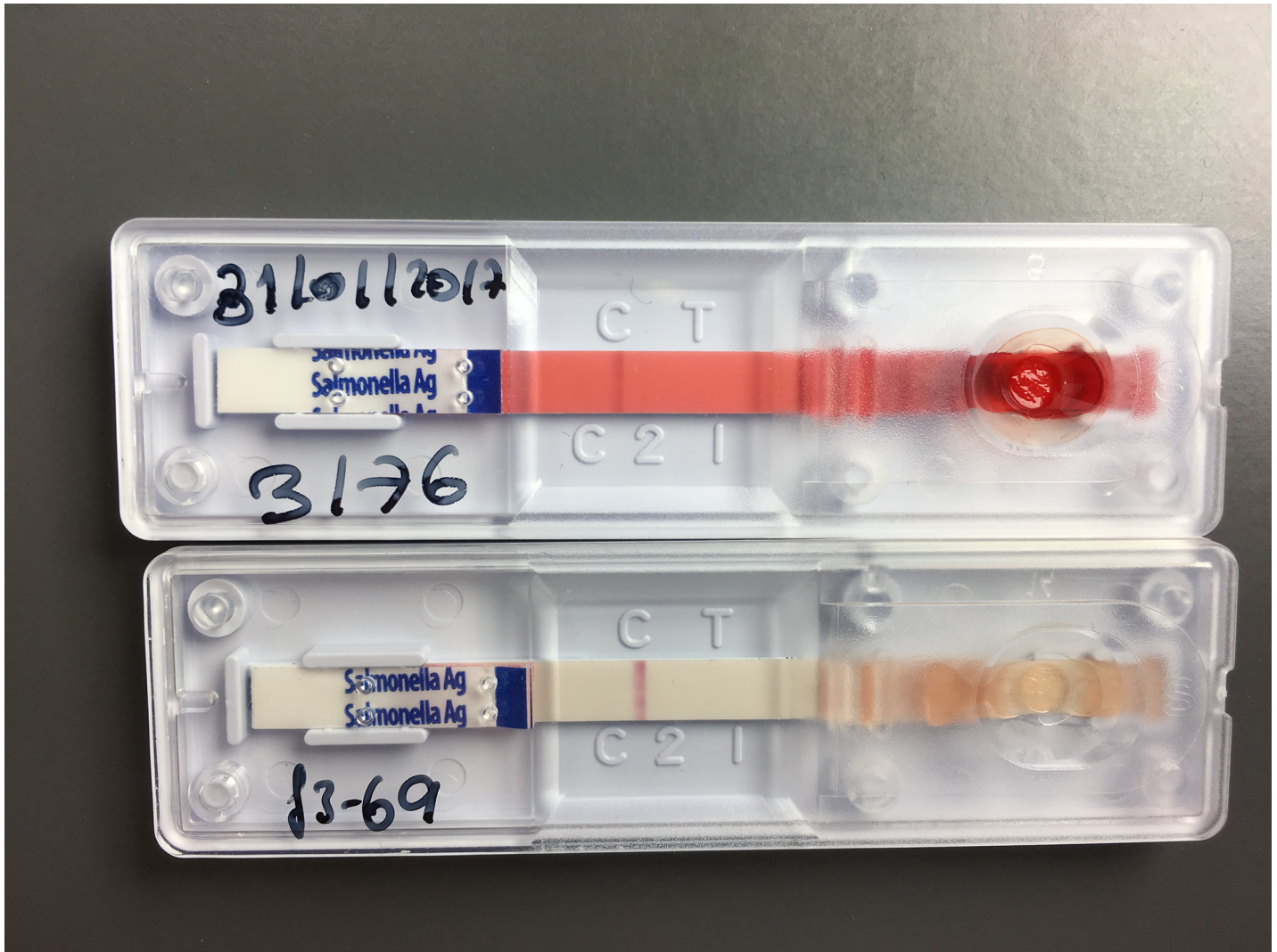
Fig 1. Variable background clearance. Both tests shown (Standard Diagnostics Bioline One Step Salmonella Typhi Ag Rapid Detection Kit) with the presence of a control line and absence of a test line, show a negative test result. Background clearance is scored poor for the test above (more reddish) and good for the test below.

https://doi.org/10.1371/journal.pone.0194024.g001