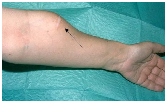
Figure 1 This figure shows the enlargement of a parathyroid autograft in a patient with recurrent secondary hyperparathyroidism, demonstrated by a knob underneath the scar.

Total parathyroidectomy without autotransplantation and without routinely performed thymectomy (TPTX) may provide an alternative strategy to the currently performed procedures mainly because of the reported lower rate of recurrent sHPT of 0–4% during long-term follow up [32,36]. Patients after TPTX did not develop hypoparathyroidism [32,36] and particularly adynamic bone dis-