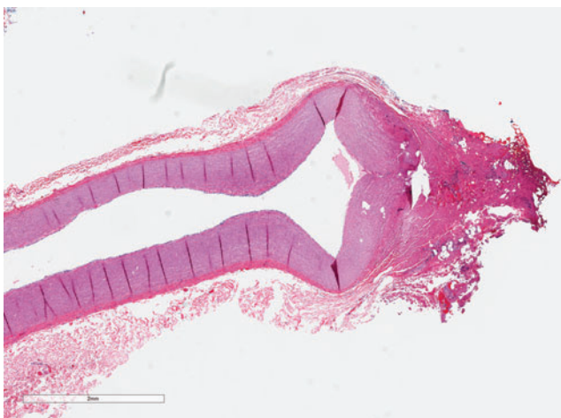
FIG. 4. Seal quality and thermal spread on an artery using EnSeal—section of artery with moderate cautery changes seen in the vessel wall with mild loss of cellular detail of the vessel wall ( upper right ).

All tested VSDs provided excellent seal quality as corroborated by histopathology and suprathysiologic bursting pressures. C5 provided the highest bursting pressure measurements at both proximal and distal jaws and consistently scored better than the other devices with regard to tissue sticking, charring, and carbonization. However, HA and HA7 provided the least thermal damage, whereas LS and ES