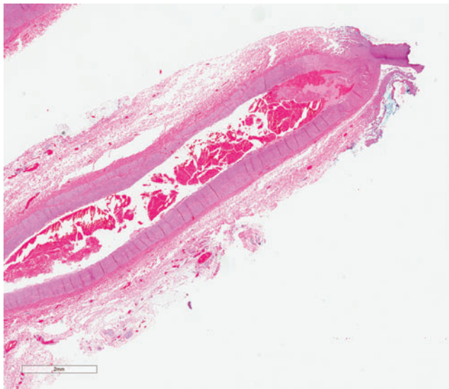
FIG. 2. Seal quality and thermal spread on an artery using Caiman 5—section of artery with moderate to severe cautery changes seen in the vessel wall with adherent fibrin and moderate loss of cellular detail of the vessel wall ( upper right ). The cautery changes permeate into the vessel wall.

All VSDs should be used with great care adjacent to vital organs, and a margin of at least 5 mm is recommended to avoid any thermal damage. 5 For both mesenteric and vessel tissues, ES and LS demonstrated the lowest jaw temperatures, whereas HA and HA7 consistently demonstrated the highest jaw temperatures across all vessel sizes. These data are consistent with previously reported studies. 5,15,16 ES and LS employ a pulsed bipolar energy and a feedback energy control output during tissue sealing and transection, which maintain the jaw temperature levels below 100°C. 17 However, of even greater importance than the recorded jaw temperature is the degree of coagulation necrosis on either side of the jaws. In this regard, HA and HA7 had the least thermal spread for both veins and arteries compared with the other three VSDs. It may seem counterintuitive that the devices with the highest jaw temperature resulted in the least