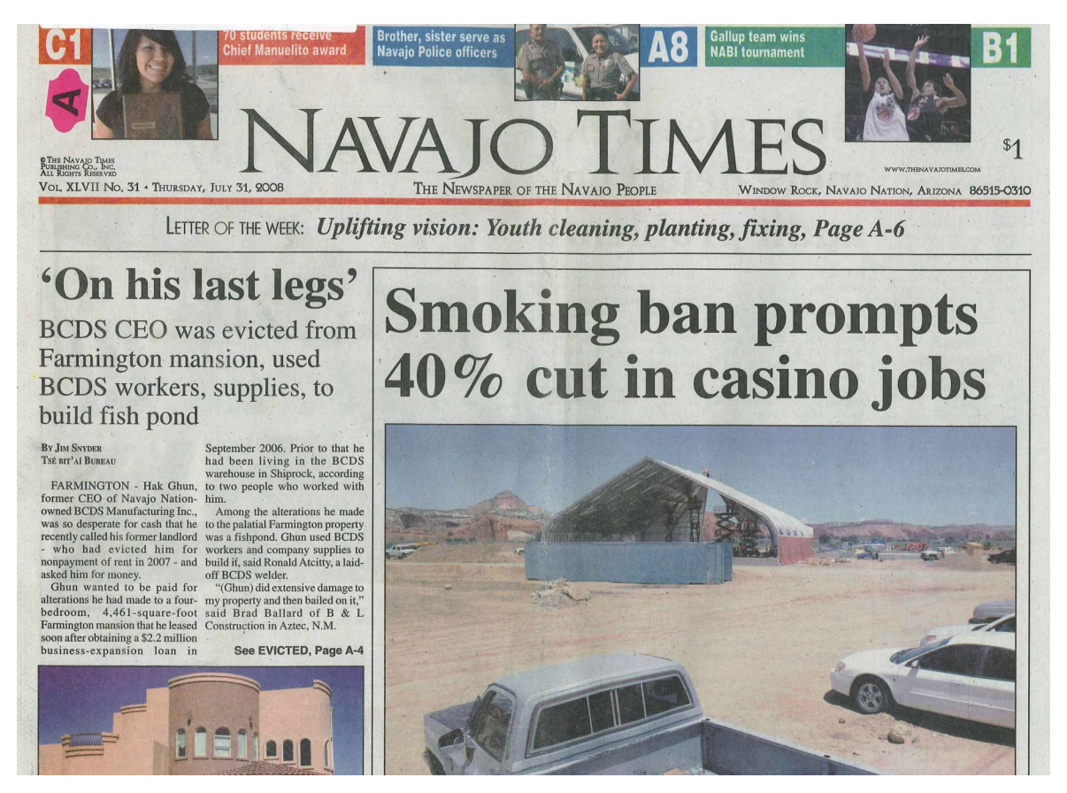
Figure 1 Navajo times headline.

evidence of a tobacco-specific carcinogen in the urine of casino workers.<sup>30</sup> With this evidence, Team Navajo launched extensive educational outreach to Navajo leaders and communities consisting of radio forums, radio and newspaper advertising and participation in events such as fairs, church-affiliated rallies and ceremonial gatherings.