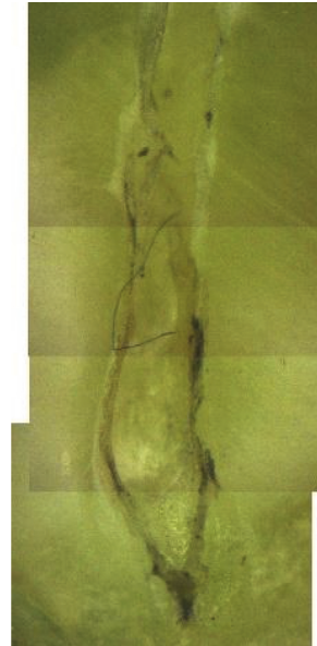
FIGURE 2: Untouched areas in the apical third of the root canal.

Endodontic treatment is one of the most conservative treatments in dentistry, and to make it a successful one, many factors should be taken into consideration. Among these factors, a significant knowledge of the root canal