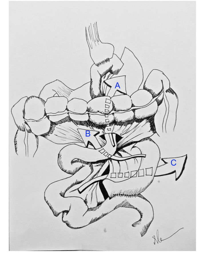
Figure 2 Internal hernias of retrocolic Roux-en-Y gastric bypass. (A) Transverse mesocolic defect. (B) Petersen's defect. (C) Jejuno-jejunostomy mesenteric defect.

endoscopy or abdominal ultrasounds and potentially delaying therapy.<sup>55 56</sup> Cross-sectional imaging may reveal telltale signs of internal hernia, such as mesenteric swirl or obstructive patterns and engorged mesenteric nodes.<sup>57</sup> However, CT imaging has a suboptimal sensitivity for internal hernias in patients with a history of bariatric operation and may be read as normal in up to 30% of patients.<sup>54</sup>