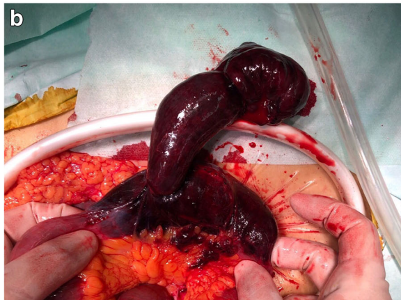
Fig. 2 Intraoperative photographs showing the tip of 5 cm long Meckel's diverticulum adhered to the adjoining small intestinal mesentery (a). A part of the adjacent intestine drilled into the narrow ring formed by the diverticulum and mesentery. After the adhesiolysis, the herniated intestine was found to have ischemic necrosis (b)

diverticulum with the gangrenous bowel with anastomosis was performed. The postoperative course was uneventful. The patient was discharged from the hospital on the fifth postoperative day. At 3-month postoperative follow-up, the patient is symptom-free and has restored normal activity and diet.