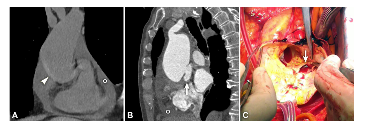
Fig. 1. A ) Coronal unenhanced computed tomography (CT) image shows a crescent-shaped thickening of the aortic wall (arrowheads) with greater attenuation than the lumen, and pericardial effusion (circles). B ) Sagittal contrast-enhanced CT image shows a localized blood-filled pouch (arrow) protruding into the intramural hematoma from the aortic lumen, characteristic for ulcer-like projection. C ) Intraoperative findings of 2 cm transverse-shaped intimal tear (arrow) identified above the non-coronary sinus.

G. Filippone et al. / International Journal of Surgery Case Reports 42 (2018) 179–181