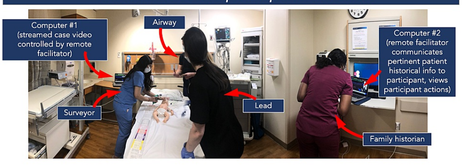
Panoramic of the participants in action