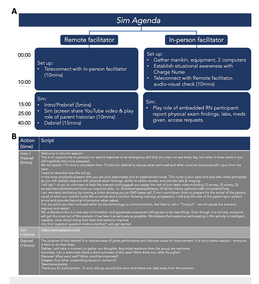
FIGURE 4: (A) Agenda for remote and in-person facilitator and (B) script for a remote facilitator for introduction, prebrief, simulation and debrief.