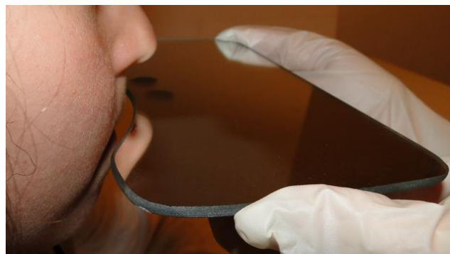
Figure 1: Administering the mirror fogging test

For this test, a rectangular mirror with dimensions 10.5 cm x 17.5 cm was used. The mirror was not marked or graded. The mirror itself is used for visual indication of the nasal airflow.