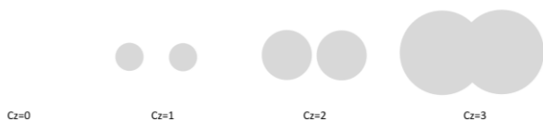
Figure 2: Rating the degree of the respondent's nasal air escape evaluated with the Czermak's test

velopharyngeal insufficiency is important, and hypernasality can be heard. If there is no fogging of the mirror, the result is marked as negative (normal result).