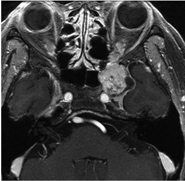
Fig. 1 Preoperative magnetic resonance imaging (MRI) in T1-weighted image with contrast enhancement demonstrated a 25-mm mass in the left cavernous sinus protruding to the left orbit via the superior orbital fissure.