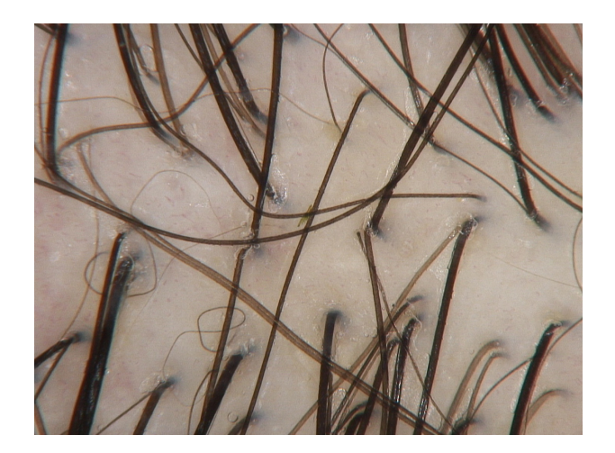
Figure 2 Androgenetic alopecia: hair diameter variability.

the scalp.<sup>11</sup> Dermoscopy of active lesions of tinea capitis reveals comma hairs, which are slightly curved, fractured hair shafts.<sup>9</sup>