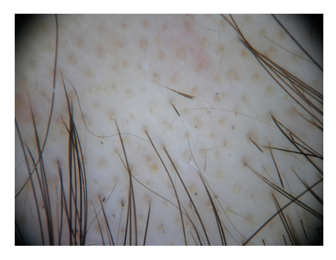
Figure I Alopecia areata: yellow dots and exclamation mark hairs.

Trichoscopy, or dermoscopy and videodermoscopy of the scalp, may reveal features of a specific type of hair loss. As an example, in the case of alopecia areata, a characteristic "yellow dot" pattern is often seen, as well as microexclamation hairs and black cadaverized hairs or "black dots" (Figure 1).<sup>8,9</sup> Dermoscopy in androgenetic alopecia reveals greater than 20% diversity in the hair diameter (Figure 2).<sup>10</sup> A brown, depressed halo at the follicular opening can be observed in early androgenetic alopecia and yellow dots can be seen in advanced cases. Further, a honeycomb-pigmented appearance can be appreciated in sun-exposed regions of