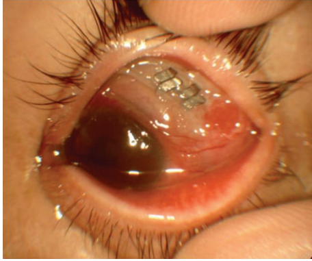
FIGURE 1: Photograph of the left eye at the time of presentation. An extrusion of the buckle which had migrated through the superior rectus muscle and infected sclera was observed through the conjunctival fistula.

The anterior segment of the right eye showed postoperative aphakia, and ophthalmoscopy revealed an attached retina with indentation of the scleral buckle at 360°. The left eye demonstrated hyperemic and chemotic conjunctiva and extensive yellowish discharge. Conjunctival fistula was present in the upper quadrants. An extrusion of the buckle had migrated through the superior rectus muscle and scleral infection was observed through the conjunctival fistula (Figure 1). An encircling band and a solid explant were removed (Figure 2), and the patient was treated with topical and systemic broad spectrum antibiotics. After the removal of the buckle, the symptoms improved rapidly and there was no recurrence of retinal detachment. His visual acuity improved to 60/200. Aeromonas hydrophila was isolated from the discharge and the removed explant. He used well water in daily life. Aeromonas hydrophila was not, however, isolated from the well water.