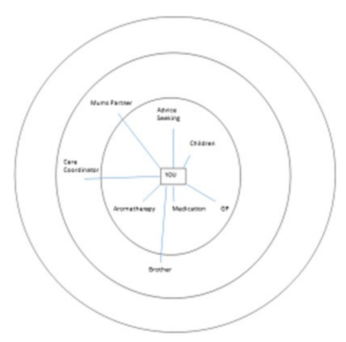
FIGURE 2 Crisis example network (same participant)

the womb almost and just stay there.' P8. The peace and quiet available in this space acted as a time for healing, for reflection, to allow private expression of emotion and a time to regather strength.