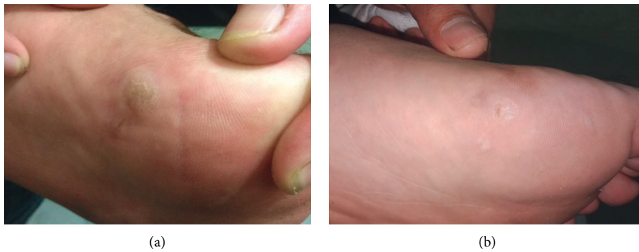
FIGURE 1: Plantar wart during baseline (a) and after one treatment session (b).

EC: electrocautery, CC: complete clearance; NC: near-complete clearance; R: recurrence.