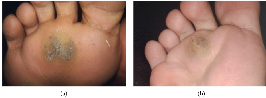
FIGURE 3: Plantar wart at baseline (a) and moderate clearance (b) after two treatment sessions.