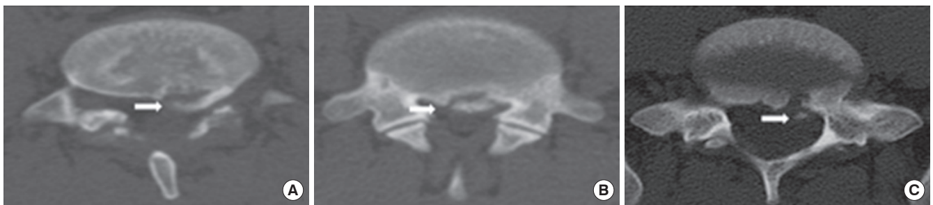
Fig. 1. Classification of posterior apophyseal ring fracture. 22 (A) Type 1, an arcuate simple avulsion of the posterior cortex of the endplate without osseous defect. (B) Type 2, an avulsion fracture of the central cortical and cancellous rim of posterior vertebra. (C) Type 3, a more lateral localized fracture involving a larger amount of the vertebral body, resulting that osseous defect anterior to the fragment is larger than the fragment. Arrow indicates the lesions of posterior apophyseal fracture.

The characteristics of patients with PARE versus those without PARE are presented in Table 1. Amongst the clinical manifestations in each group, there was only one significant result in the severity of whole discomforts using VAS: median VAS 6 (4–7) in patients having PARE versus median VAS 4 (3–5) in patients without PARE. However, we did not find any significant