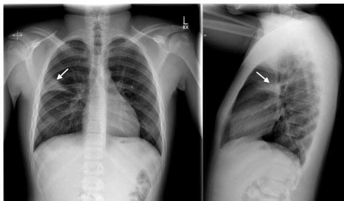
Figure 2. Anterior-Posterior chest radiograph on day 6 showing consolidation of the inferior segment of the right upper lobe (arrows).

Six days after symptom onset the patient returned to the ED with worsening pain despite oral analgesics, a low-grade fever and a worsening dry cough. On physical examination the patient was well appearing and in no apparent distress. His temperature was 99.8 °F; his blood pressure was 105/72; his heart rate was 95 beats/minute; and his oxygen saturation on room air was 99%. A previously planted PPD was read as negative. We obtained a repeat chest radiograph, which revealed a wedge-shaped consolidation in the inferior segment of the right upper lobe (Figure 2). The patient was treated with an oral cephalosporin as an outpatient with complete resolution of his symptoms.